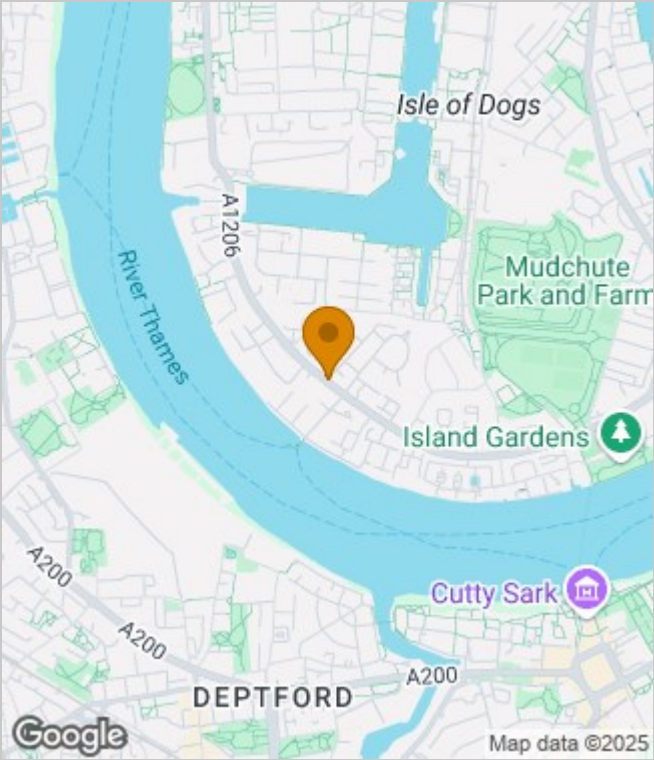
Energy Performance Graph